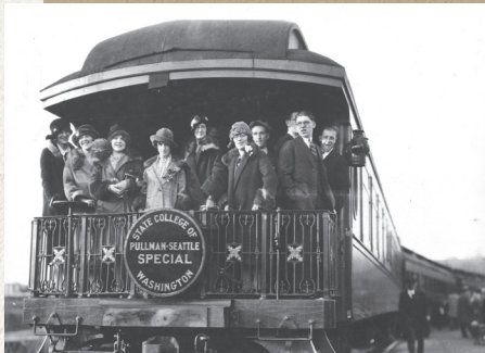
Student Special platform

A replica of an original train platform will be constructed at the end of the passenger car with help from the McGregor Company, Colfax. Designed to represent a feature on the trains which brought students to campus between 1916 and the early 1940s, it will provide an alluring place for photo opportunities.